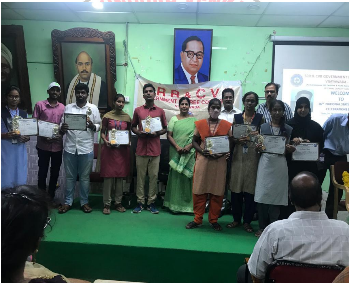
Celebrations of National Statistics Day on 29-06-2022