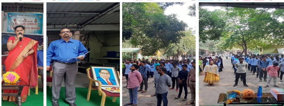
National Voters Day Celebrations on 25-01-2022