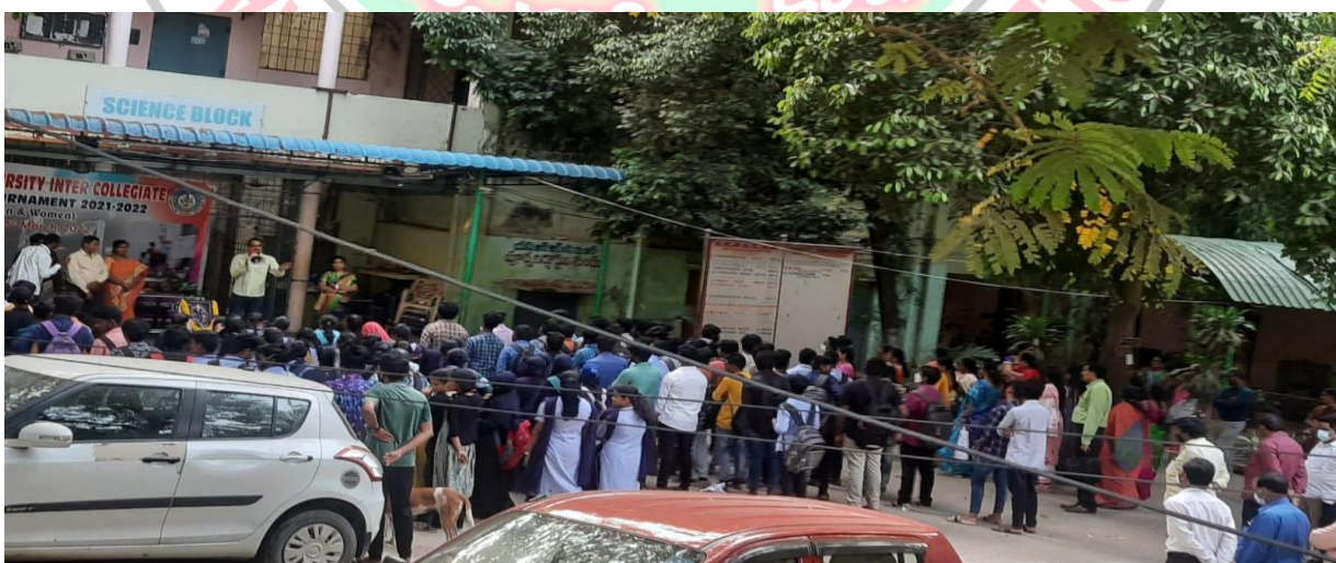
Celebrations of Dr. BR Ambedkar Jayanthi by NSS Units on 14-04-2022