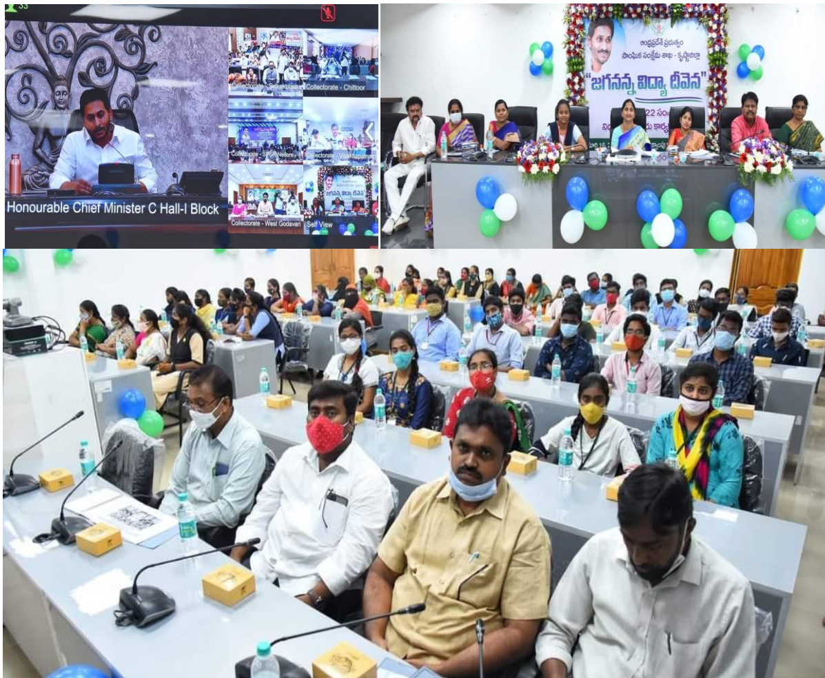
Participation in JVD(AP Govt.) Event on 16-03-2022