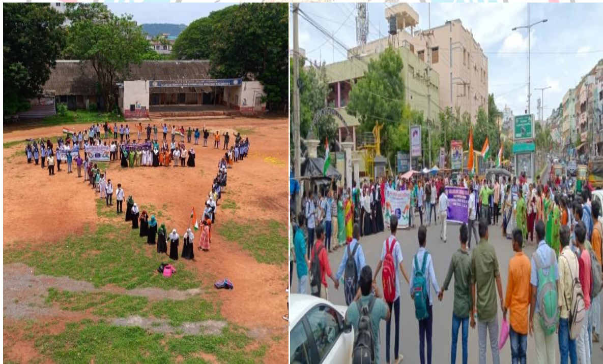
Indian Map Demonstration and Mass Rally on the Eve of Celebrations of Azadi Ka Amrit Mahotsav as a part by NSS Units on 10-08-2022