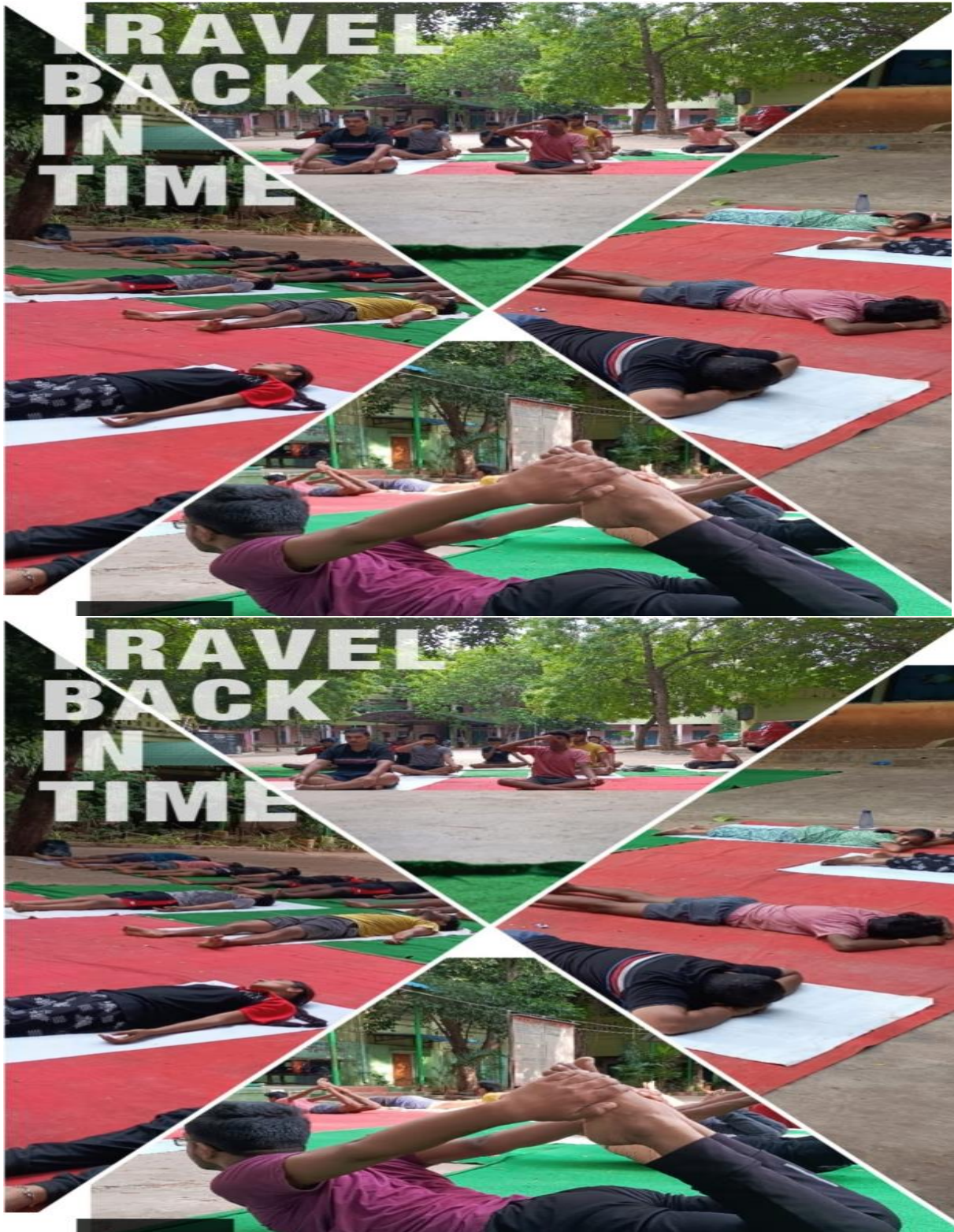
Common Yoga Protocol Training Programme from 13-06-2022 to 21-06-2022