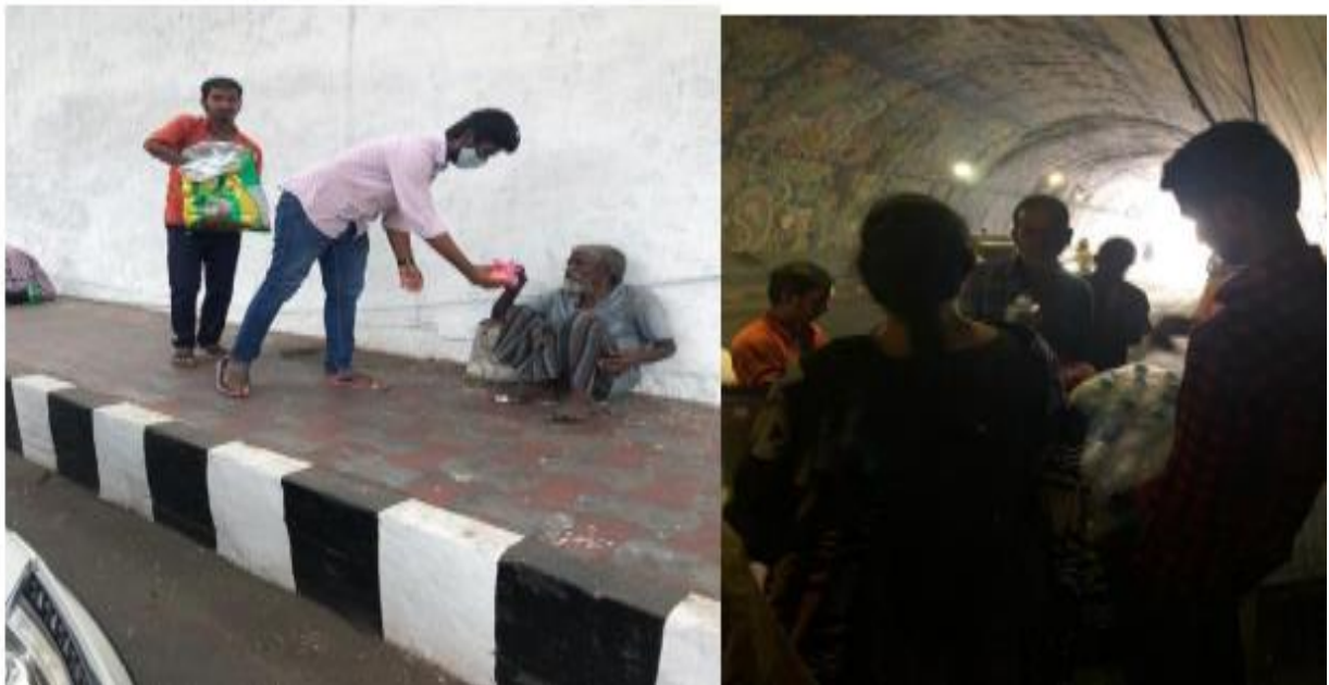
Distributing of food to the Beggars at Vijayawada Tunnel & Railway Station Road by III MPC students on 06-03-2022