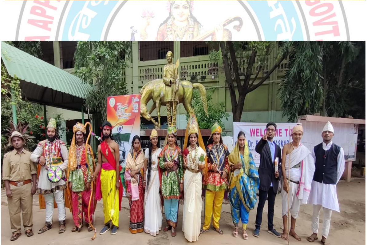
Acted as Freedom Fighters in AP Govt. Programme on the Eve of Celebrations of Azadi Ka Amrit Mahotsav on 14-08-2022