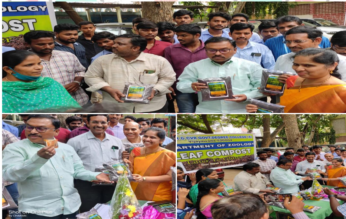
Selling of Leaf Compost Packets at a cost of Rs. 50/- by Zoology Students on 24-08-2022