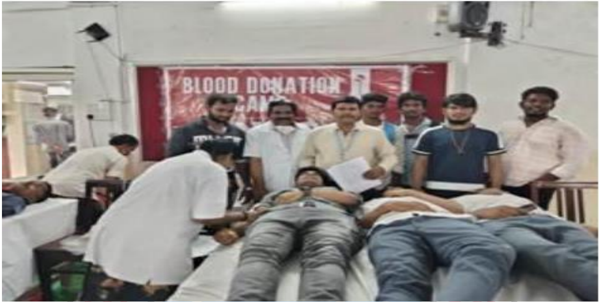
Participation in Mega Blood Donation Camp at KBN College, Vijayawada on 04-05-2022