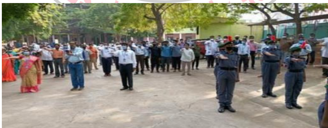
Pledge in Republic Day Celebrations on 26-01-2022