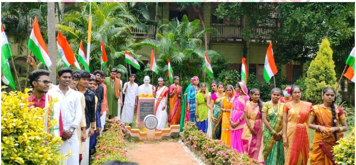
Representing Various States Culture on the Eve of Celebrations of Azadi Ka Amrit Mahotsav on 14-08-2022