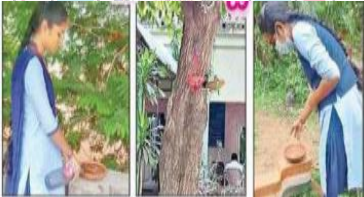
Feather Friendly Nosh on 28-04-2022