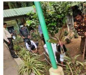
Plantation in Campus by NSS students on 08-04-2022