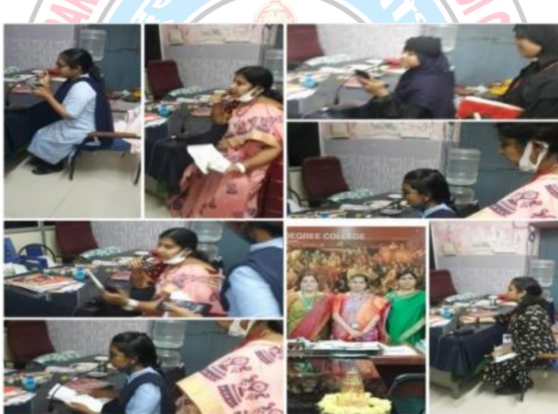
College Radio on 25-06-2022