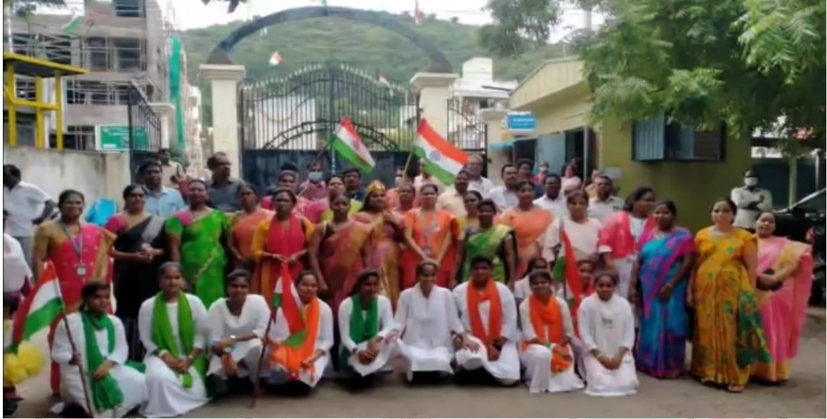
Participation in Flash Mob & Bike Rally on the Eve of Celebrations of Azadi Ka Amrit Mahotsav on 14-08-2022