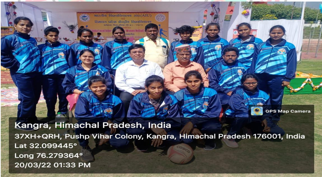
Participation in All India Inter University Competitions from 19-03-2022 to 23-03-2022 (Women Netball Players)