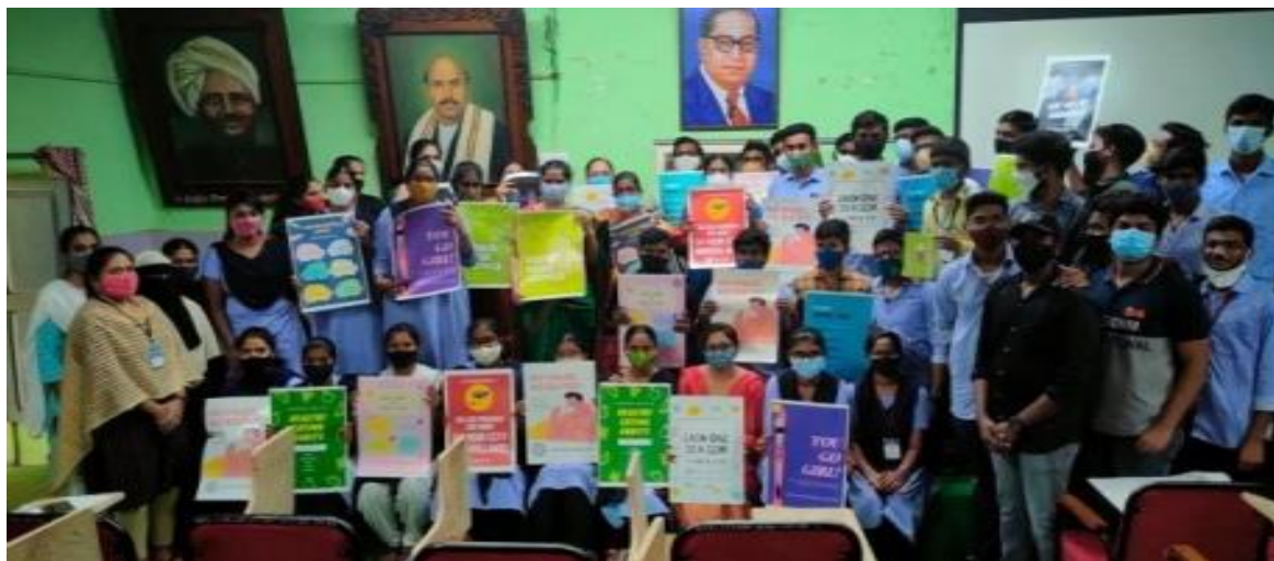
Release of College Best Initiative Poster on 20-01-2022