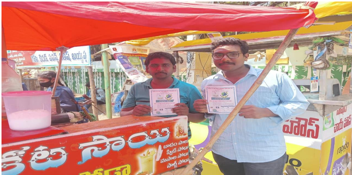
Students Distributed Pamphlets to the people to follow the water saving techniques