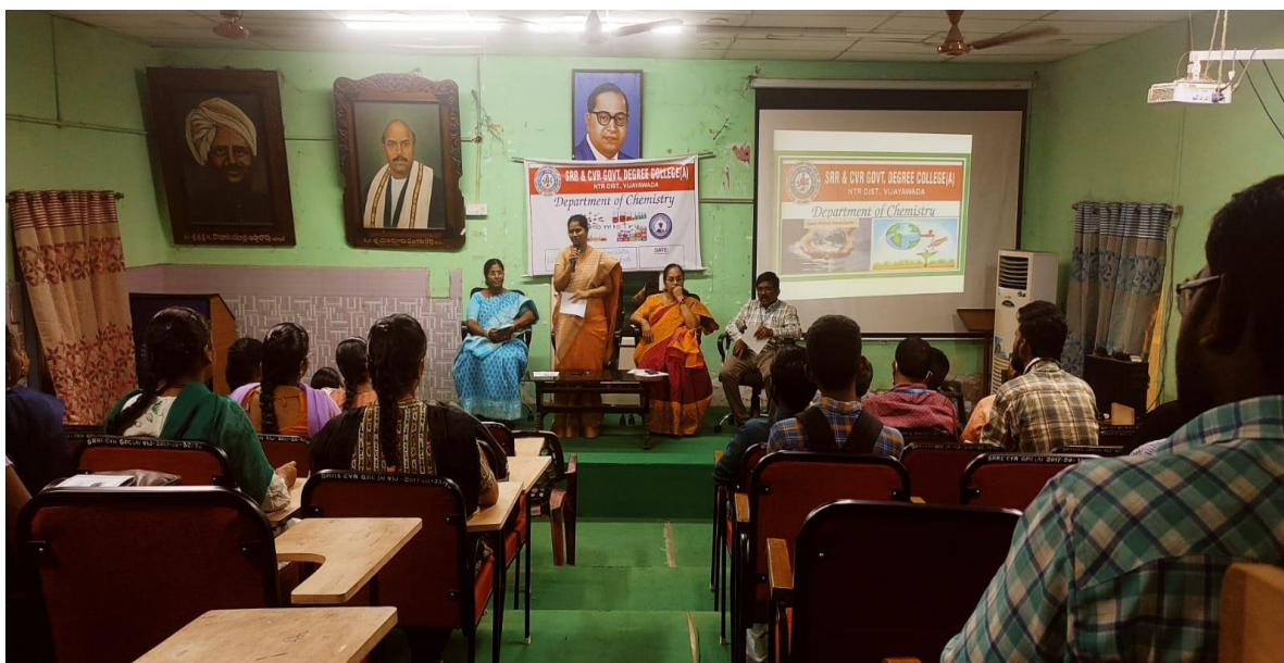
Principal Madam delivering speech on the importance of World Water Day