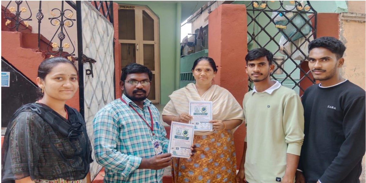
Students Distributed Pamphlets to the people to follow the water saving techniques