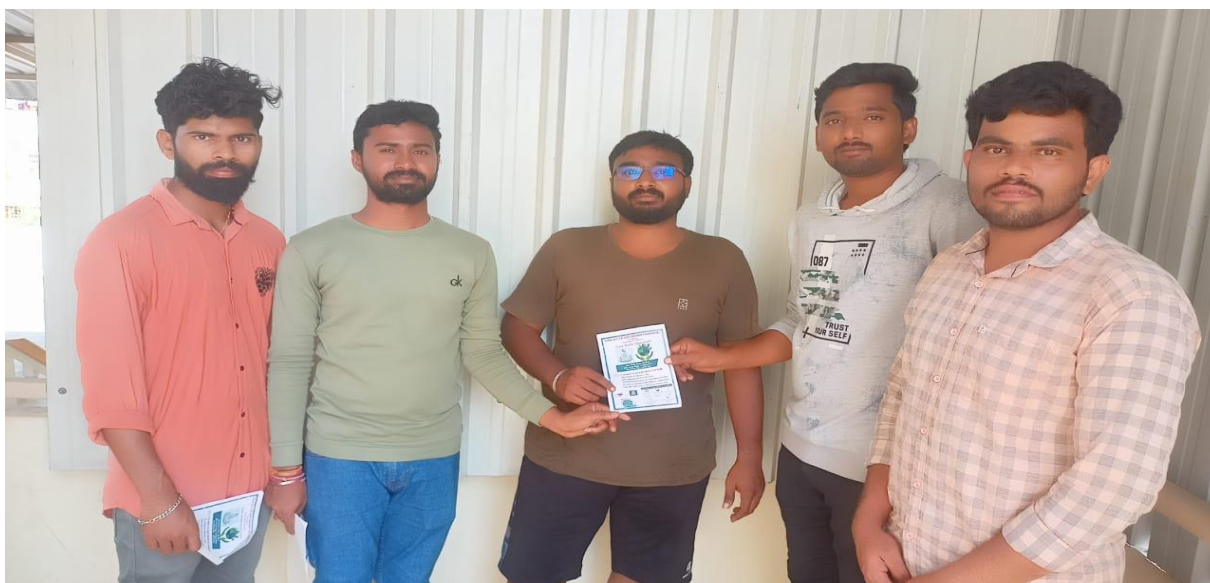
Students Distributed Pamphlets to the people to follow the water saving techniques