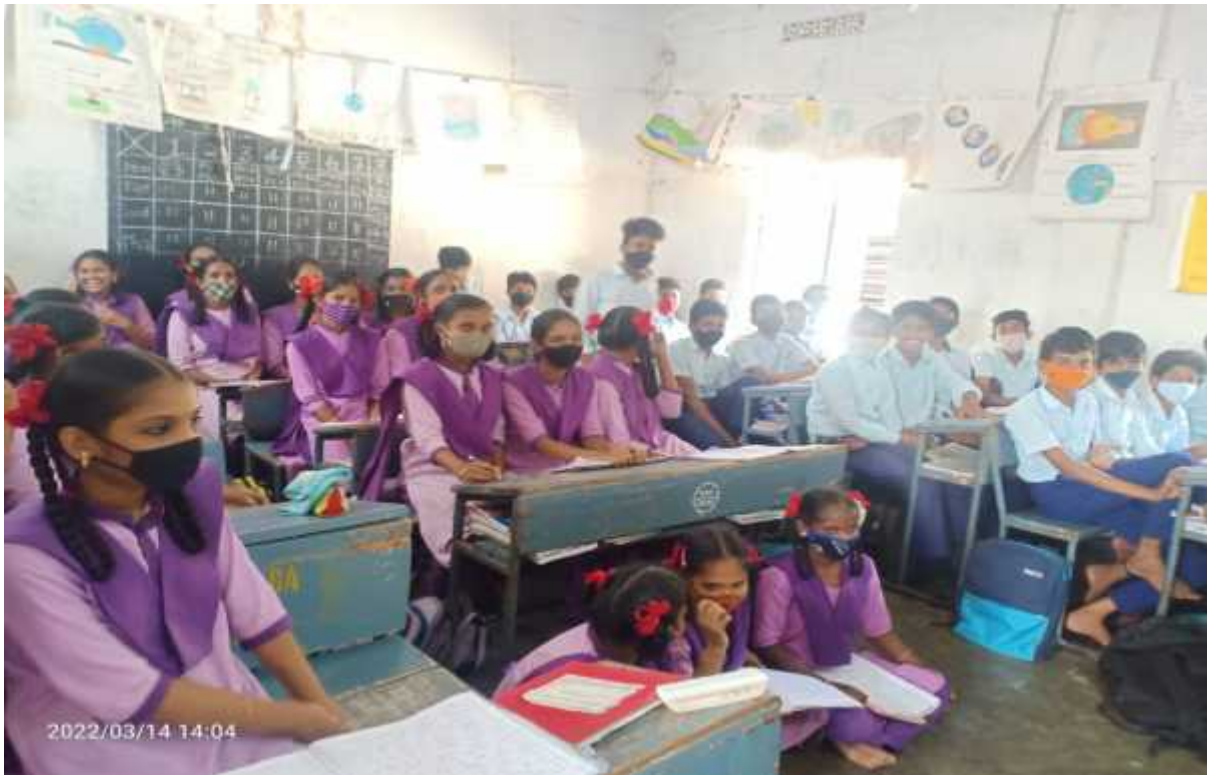
Interaction with the students of T.M.R & C.M.C High School, Vijayawada