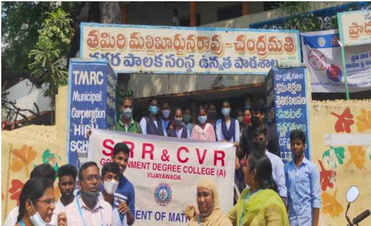
Students & Staff of Department of Mathematics at T.M.R & C.M.C High School, Vijayawada