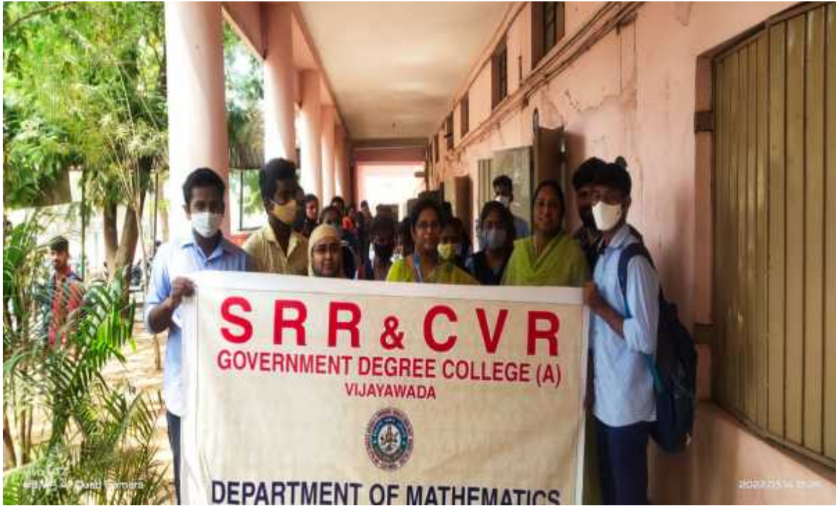
Students & Staff Started from the Department of Mathematics