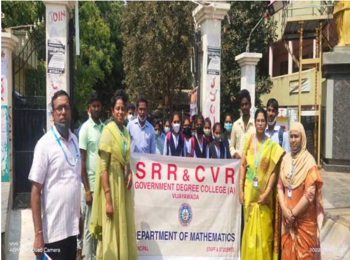
Students & Staff of Department of Mathematics