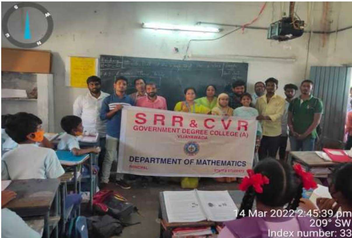
At Class Room of T.M.R & C.M.C High School, Vijayawada