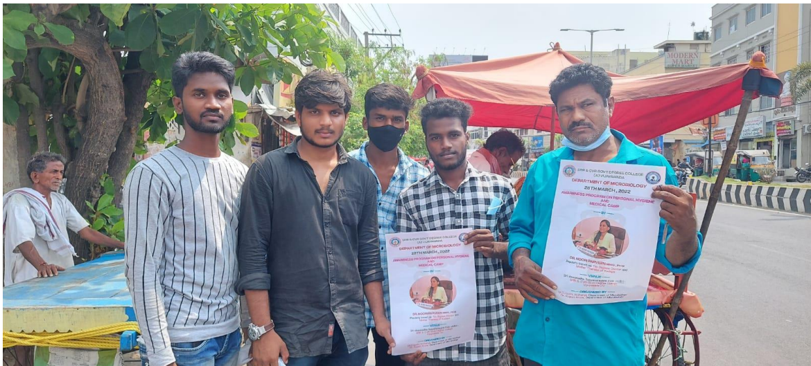
CAMPAIGN BY III BSC MICROBIOLOGY